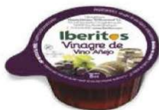
Vinagre de vino añejo 8ml /Wine vinegar