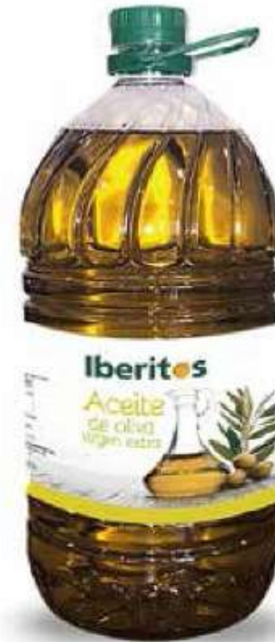
Aceite de oliva virgen extra 5 l /Extra virgin olive oil 5 l