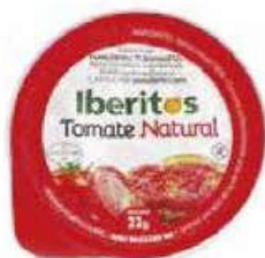
Tomate Natural /Natural tomato