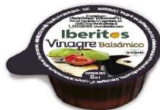
Vinagre balsámico 8ml /balsamic vinegar