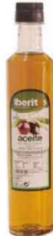
Aceite de oliva virgen extra 500ml /Extra virgin olive oil 500ml