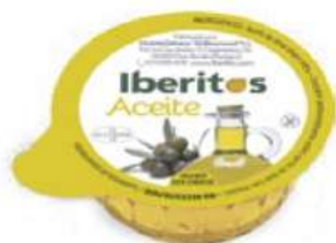
Aceite de oliva virgen extra 10ml /Extra virgin olive oil