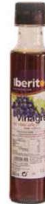
Vinagre de vino añejo 250ml /Wine vinegar 250ml