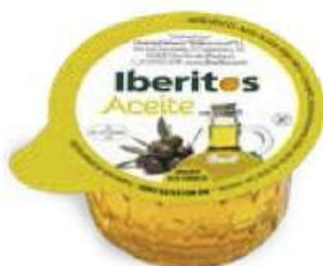
Aceite de oliva virgen extra 18ml /Extra virgin olive oil