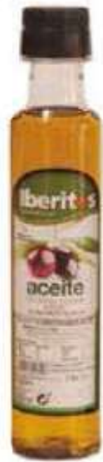
Aceite de oliva virgen extra 250ml /Extra virgin olive oil 250ml