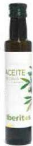
Aceite de oliva virgen extra 250ml /Extra virgin olive oil 250ml