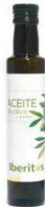
Aceite de oliva virgen extra 500ml /Extra virgin olive oil 500ml