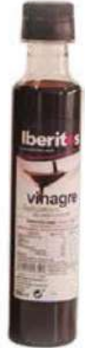
Vinagre de vino balsámico 250ml /balsamic vinegar 250ml