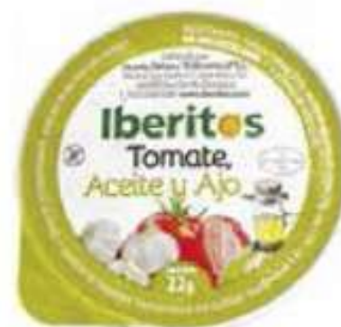
Tomate, Aceite y Ajo /Natural tomato with extra virgin olive oil and garlic