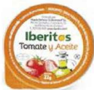
Tomate y Aceite /Natural tomato with extra virgin olive oil