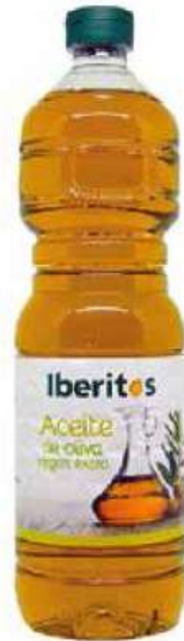
Aceite de oliva virgen extra 1 l /Extra virgin olive oil 1 l